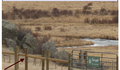
From State parking to 3-pole walkthrough.

metal gate. Go through the 3-point walk-through to the left of the gate. At the river, you can climb over the fence to go upstream. (Please do not park out on the rocky point just north of the State parking, it is on private land.)