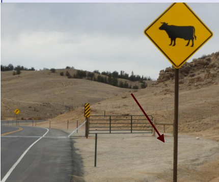
Facing North—both sides of the gate are public land

Point 3: To access the stream at the stream gage downstream from Stagesstop, park along the road where the gates allow cattle to bypass the cattle guard. The land on both sides of the cattle guard is public land.