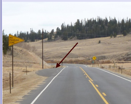
Facing South—pullout is on left.

Mountain Ranch road, you can park on the paved pullout along CR 77 just north of the gates into Topaz Mtn Ranch. Cross the road and there is public land is to the north of the two gates installed on the dirt road to Topaz Mountain Ranch (to your right as you face the gates). Public land extends to the river. The access purchased for the TFC begins at the second gate and runs south from the 2nd Topaz gate along the right side of the fence to the river.