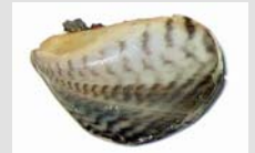
Quagga mussel actual size is 3/4 inch.

Can I just use regular household salt? Do Not Use any other kind of salt solution. Household salt used for seasoning and food consumption is Sodium Chloride (NaCl). It will not kill quagga mussels.